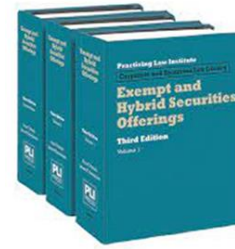
PLI's Exempt and Hybrid Securities Offerings (4th ed., 2022 update)