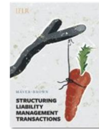
IFLR's Structuring Liability Management Transactions (2018)