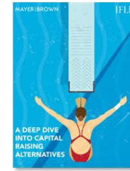
IFLR's A Deep Dive into Capital Raising Alternatives (2020)