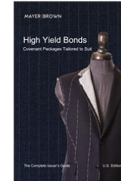
High Yield Bonds (2023)