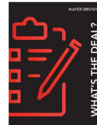
What's the Deal (2022)