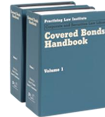
PLI's Covered Bonds Handbook (2014)